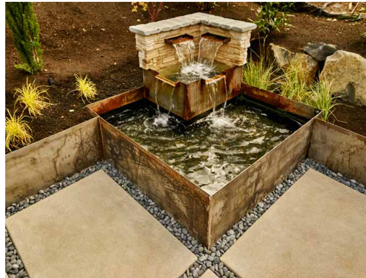
TOP: The homeowners wanted simple, easy-to-clean, timeless interiors, which inspired the kitchen’s grain-matched white maple cabinetry as well. BOTTOM: The backyard water feature trimmed in stone incorporates steel “gone natural.”