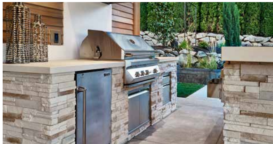
PREVIOUS PAGE: Joie de Vivre’s dramatic floor-to-ceiling, aluminum-framed windows are rarely found in residential homes. TOP: The sculptural staircase is warmed by wood contrasted with metal texture for beauty. MIDDLE: Stone and wood express the home’s sleek, contemporary lines, which are also found in its outdoor rooms (right).